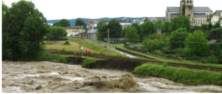
Figure 2. A picture of the railway line, on 18 th June 2013

With a major constraint to reopen the line before August 15th, reinforcements were studied and applied in order to rebuild and stabilize the railway embankment. Indeed, although the Gave de Pau was still flooded and with a short time window (60 days) for works, the followings repair works were carried out [Ponchart & Chretien 2014]: