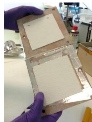
Figure 1: Illustration of painted plates used in the study

The dry paint weighs 5.4 g for the homemade nano-TiO 2 enriched paint (with a standard deviation of 0.4g) and represents the nanomaterial tested in our study. A painted plate allowed generating sufficient number of particles in the aerosol form for a 30 minutes exposure. Abrasion tests were performed using a rotating abraser sander to mimic the mechanical abrasion process (Figure 2).