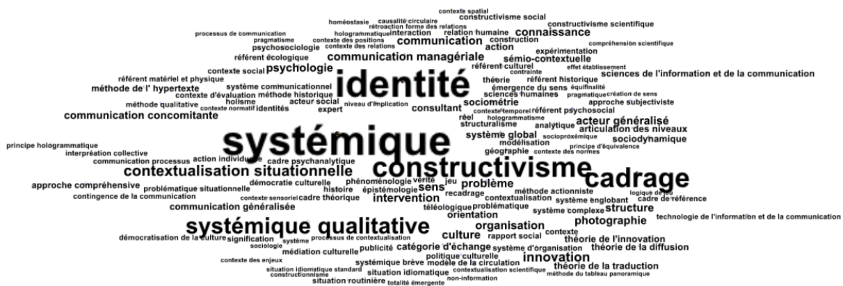
Fig. 3. Visualization of the global system

The <position> and <relation> tags inherent in the SCAC markup model allow us to extract from the entire corpus of the relations between the concepts expressed by the authors of our corpus. Thus, we were able to modelize the global system with the concepts composing the corpus via statistical weighting of links (strong, moderate or weak) between nodes.