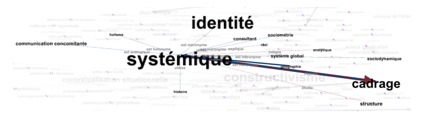
Fig. 4. Pattern "Systemic"

The statistical weighting also allows us to make emerge the dominant patterns from our corpus. The figure 4 highlights the existing interconnections around a strong concept of "systemic". The links between concepts are more or less marked the one hand according to recurrence but also according to the consensus among the authors on the links typification.