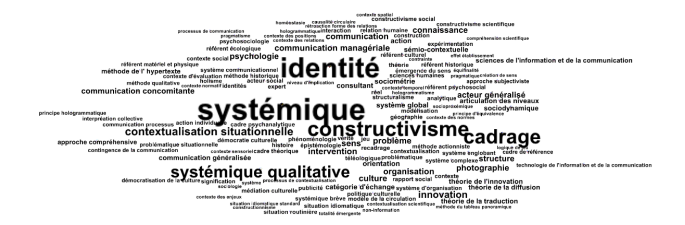
Fig. 3. Visualization of the global system

The <position> and <relation> tags inherent in the SCAC markup model allow us to extract from the entire corpus of the relations between the concepts expressed by the authors of our corpus. Thus, we were able to modelize the global system with the concepts composing the corpus via statistical weighting of links (strong, moderate or weak) between nodes.