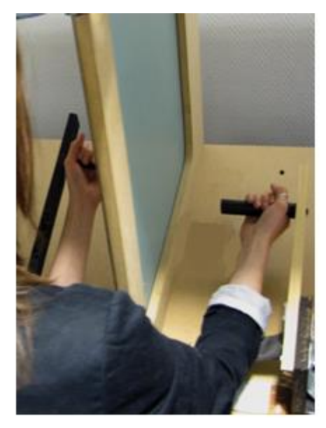
Figure 1. Illustration of the experimental setup for the kinesthetic mirror illusion task. The participant sat at a table and faced a box compartmentalized by a vertical mirror. Left: the participant's left arm was supported by a motorized manipulandum that could flex the arm. Visible to the participant, the vertical mirror reflected the image of their left arm. Right: invisible to the participant, their right arm was supported by a static manipulandum and held at a 15° angle.