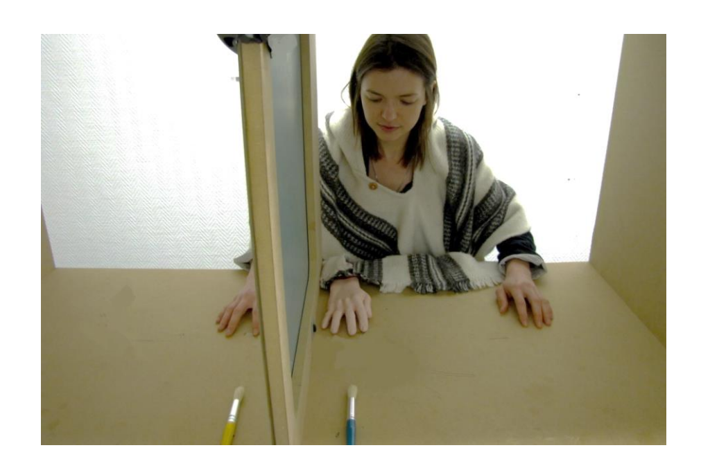
Figure 2. Illustration of the experimental setup for the rubber hand illusion task. The participant sat at a table and faced a box compartmentalized by a vertical opaque board. The participant's right hand was occluded from view by the opaque board; the rubber hand was placed in front of the participant.

were performed at the same time, at the same frequency and on the same location for both the fake hand and the real hand. Strokes always went from the top of the hand, just above the knuckle, toward the fingertip, with a constant frequency of approximately one stroke per two seconds. In this condition, the participant was expected to experience the rubber hand illusion (i.e., feel the touch applied to the fake hand, as if it was incorporated in their body schema). In the control condition, the strokes were asynchronous: the fake hand and the real hand were touched at different times in different locations. No illusion was expected in this condition.