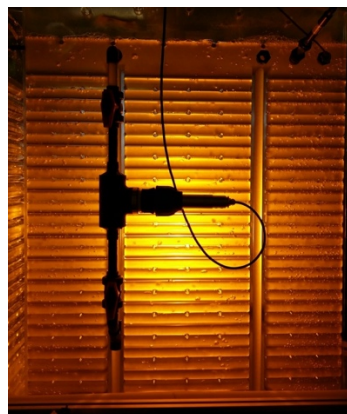
Figure 3: One of the system for growing large quantities of Asterionella formosa in Cadarache

Asterionella formosa was one of the microalgae studied by the team of biologists. They had acquired it from a British colleague who supplies them with lake water samples (Interview 4, biochemist, February 2016). The biologists then provided the team in Cadarache with small flasks containing cultures of Asterionella ; there, Asterionella is cultivated in larger quantities and at higher concentrations: flasks, 5 and 10 litres Schott bottles, 30 litres photobioreactors (Figure 3). The biologists also extracted DNA from the consortium of algae and bacteria, that they sent to a genetic platform in Toulouse for sequencing. The sequences – long series of As, Ts, Gs and Cs – were sent as computer files to the bioinformaticians who analyse them. From the beginning of the collaboration, Asterionella thus underwent several transformations just to be adapted to the different research settings of the teams involved.