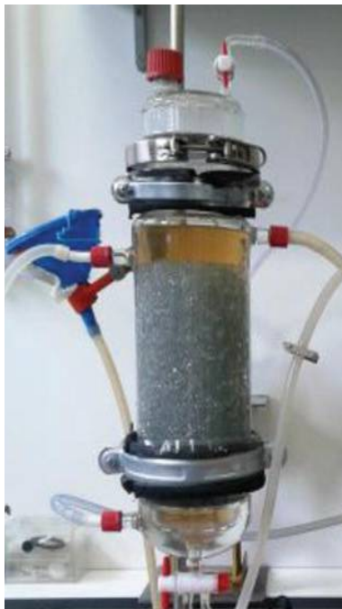
Figure 1: The bioreactor designed for biohydrogen production

None of the two teams involved work primarily on energy, but hydrogen production relates to the research interests of both. The microbiologists have long been specialised in the metabolism of hydrogen in bacteria; in other words, they work with micro-organisms that use and/or produce hydrogen. The process engineers work on waste water treatment, and producing hydrogen from waste water to then use it as an energy vector falls within their scope, as it is a means to improve the energy efficiency of the process (Interview 9, March 2016). 6