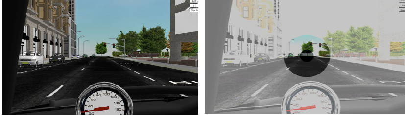
Figure 2: the COSMODRIVE virtual eye, as implemented on SiVIC

received by the Perception module from the Cognition module. Each query requires to focus the virtual eye on a specific area of the road scene. Perceived data is then integrated into the implicit and the explicit mental representations of the Cognition Module.