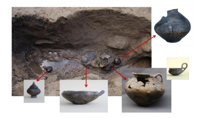
Fig. 2. tomb SP700633 with set dipsosition.

Primary burial oriented north-est/south-west discovered in the southern part of the survey. The tomb is characterized by five layers where the first one is the covering system made up of an heap of tuff, immediately below a layer of lapillus covered the skeleton and the associated set, while the last one corresponds to the cut of pit (2,47 m of lenght, 1,10 m of width). The body belonged to an adult female laying on the back with her head oriented south/west. The set consists in seven objects found between the upper and lower quarters of the tomb (Figure 2), specifically: a pyxis closed to the right side of the skull; a bronze fibula at the right side of the chest togheter with an amber pearl; sequentially next to the feet a shallow bowl; an upside down amphora with a cup within; and an askos for last [3].