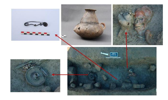
Fig. 5. tomb SP700753 with set dispositon

Primary burial oriented North/South found in the eastern part of the survey. The tomb is characterized by five layers of where the first one is the covering system made up of an heap of tuff, immediately below a layer of lapillus covered the skeleton and the associated set, while the last one corrisponds to the cut of pit (2,36 m of lenght, 1,98 m of width). The body belonged to a generic male adult laying on the back with his head oriented southward, facing North. The set consists in five objects found between the upper and lower quarters of the tomb (Figure 5), specifically: a biconical jug close to the right side of the skull; a bronze fibula to the left side of the chest; sequentially next to the feet a shallow bowl containing an askos ; and beside the right foot a bronze spear cusp [3].