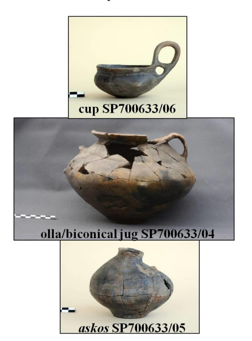
Fig. 6 sets for beverage consumption from tomb SP700633.

As the analysis were conducted in a series of ceramics issuing from the same context, the comparison of qualitative and quantitative data can be cautiosly considered. For example, tartaric acid is present in very variuos proportion. Three vases belonging to the same set, specifically the bowl (SP700743/04), the amphora (SP700743/05) and the cup contained in it (SP700743/06), have revealed a high tartaric acid concentration in a way we can deduce they were filled with wine at moment of deposition.