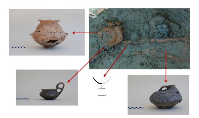
Fig. 4. tomb SP700743 with set disposition