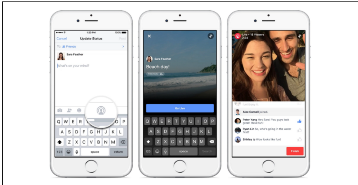
Figure 2. Facebook Live application for iPhone (Lavrusik and Tran, 2015).