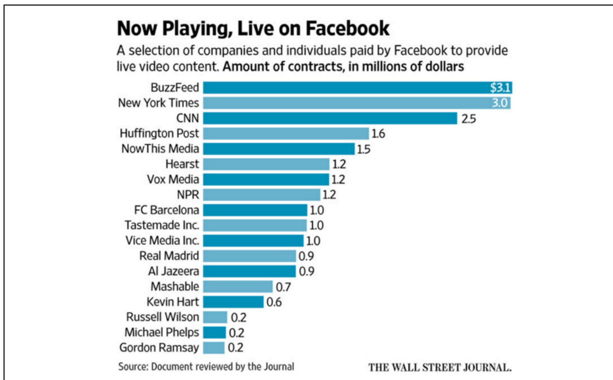
Figure 3. Facebook Live media deals (Perlberg and Seetharaman, 2016).