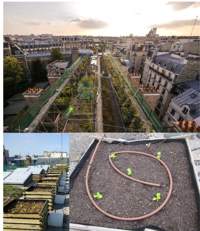
Fig. 1 Upper panel: Overview of the rooftop of AgroParisTech in March 2015. Lower panel, left: Experimental devices in April 2013. Lower panel, right: Top view of an experimental plot with the drip irrigation system in April 2014.

Vegetables were grown in wooden boxes (90 × 90 × 40 cm) typically used as backyard composters and separated from each other by at least 50 cm. The Technosols were surrounded by a geotextile membrane extending to the top of the box. An impermeable membrane lined the bottom of each box, allowing water to be stored beneath the Technosol in a 5-cm-deep volume filled with clay balls, which acted as a reservoir of water. An evacuation pipe at the top of the reservoir directed the overflow water to a collection tank (Fig. 2a).