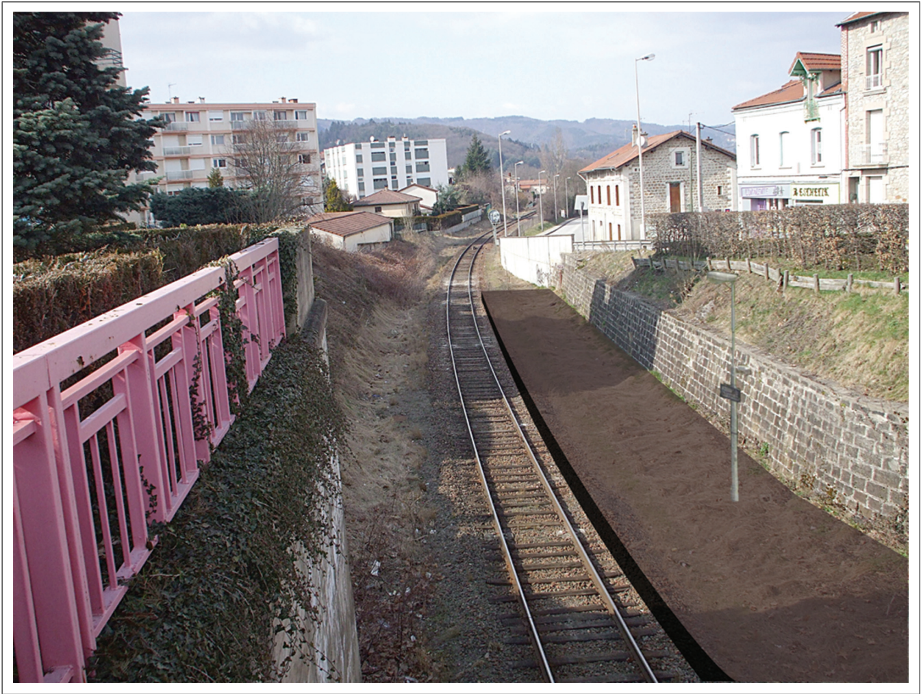
Fig.1 Location of the projected tram-train new stop in Fraisses-Ville with a proposed platform on the right