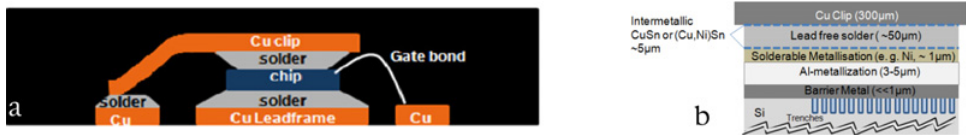
Figure 1. a) Inner structure and 1b) layer composition of a MOSFET with a copper clip.