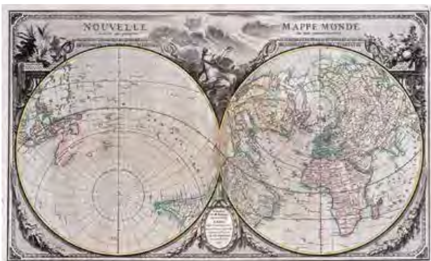
Fig. 1 – New world map by Nicolas-Antoine Boulanger (1760). ■

Global geophysical observations – that greatly increased in number throughout the 19 th century with the institutionalization of Earth Sciences – thereafter promoted an interconnected and global picture of the vast aquatic areas. In the early 19 th century, with the work of Alexander von Humboldt, maps and graphs begin to circulate, describing the ocean on a global scale, and integrating a holistic view of the environment. Our present representations rely directly on this tradition of providing logical descriptions of the laws of nature. For example, in recent geography textbooks, the image of the global ocean appears as a visual construction, where land masses are represented in the form of patterns and figures that emphasize mutual dependencies (represented by arrows and feedback loops), often including a strong historical dimension capturing the long history of environmental interactions between the ocean, the continents and the atmosphere.