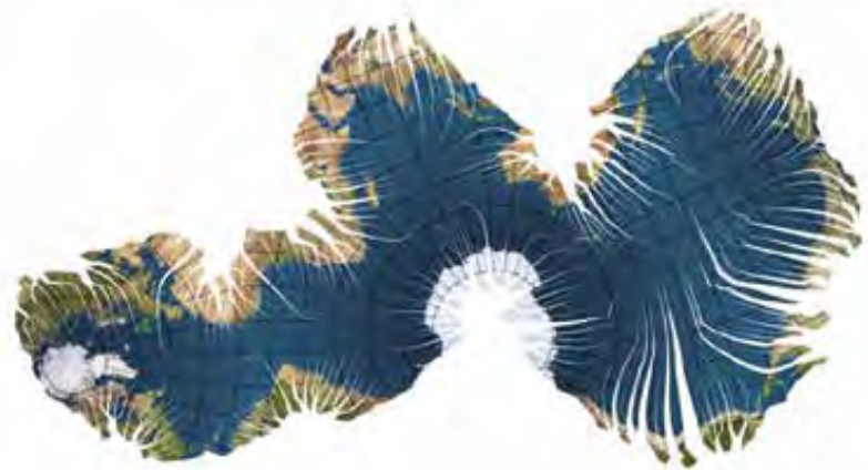
Fig. 3 – The coastline of the Earth proposed by Jack van Wijk in 2008 with a minimum of distortion. ■

global ocean is represented as a single unit, his planisphere has the advantage of being able to visualize global ocean processes (such as the thermohaline circulation) continuously. Geographers thus still have the will to overcome territorial conventions in favor of a global vision of the ocean, which today, remains an exciting field of research.