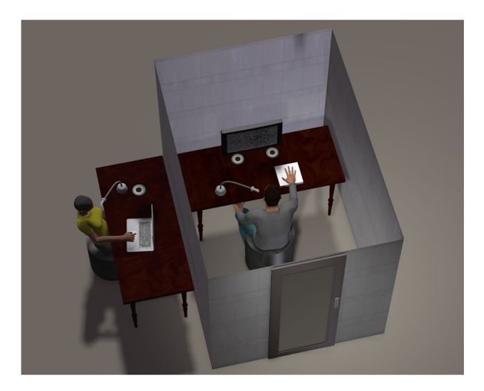
Figure 1. Representation of the experiment setup. The sound-proof testing chamber is shown without its roof.

more recent study ^{11} found that runners spontaneously adapt their cadence to the tempo of the music they are listening to while running.