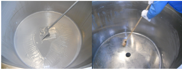
Fig. 1. Current tank scrubbing (on the left) and scratching (on the right).

As a support, models of solutions (which nature can vary from sketches, to cardboard mock-ups, computer models, and prototypes) and "action scenarios" are developed. Action scenarios allow to "play out" situations that operators may have to deal with in the future and reflect the variability of situations emerging from the activity analysis [6]. Iterations of these participative simulations – with increasing representativeness of the real-world work – enable operators to assess if they can manage the wide range of situations they are used to face with the designed interactive robot. These participative simulations also allow to develop operators' future activity [9] and the future process at the same time as designing the technical solution.