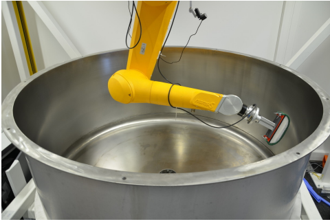
Fig. 4. Tank cleaning prototype: robot with scratching tool, placed above the tank replica.