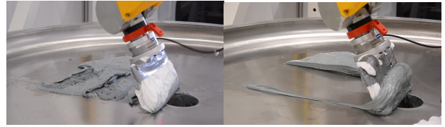
Fig. 6. Unsuccessful (left) and successful (right) automatic scrubbing.

Scrubbing, scratching and finishing experiments were conducted to determine the feasibility of automating these cleaning stages. A position/force control was used [32] with the force applied normally to the surface and position controlled in the surface plane. We can notice that satisfying scrubbing results were obtained for a nominal substance quantity (Fig. 6). In particular, these experiments revealed that tangential speed and normal force are determining factors. Less conclusive results were obtained for scratching and