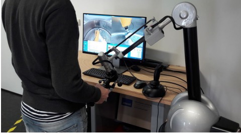
Fig. 5. Control station prototype: an operator is using the master arm to remote control the slave robot through camera views displayed on a screen.

of two parts (lateral and bottom). This prototype, set up on CEA Tech's TROPIC platform 1 , is illustrated on Fig. 4.