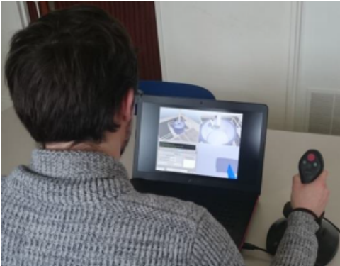
Fig. 3. Simulation setup on the interactive computer model: an operator is using the joystick to control the virtual robot through virtual camera views.

teleoperation, a 2-axis joystick was implemented to move the tools in a tangent direction to tank's surface. The tank being cylindrical, moving the joystick up and down would move the tool along a radius, and moving left and right would move the tool along an horizontal circular arc. Tool's orientation was constrained to face tank's axis of revolution. A joystick button was used to control when the tool touches the surface. A simple graphical user interface was designed for the supervisory control. V-REP virtual cameras were used to give visual feedback on the remotely performed virtual task. The experimental setup for participative simulation is shown in Fig. 3.