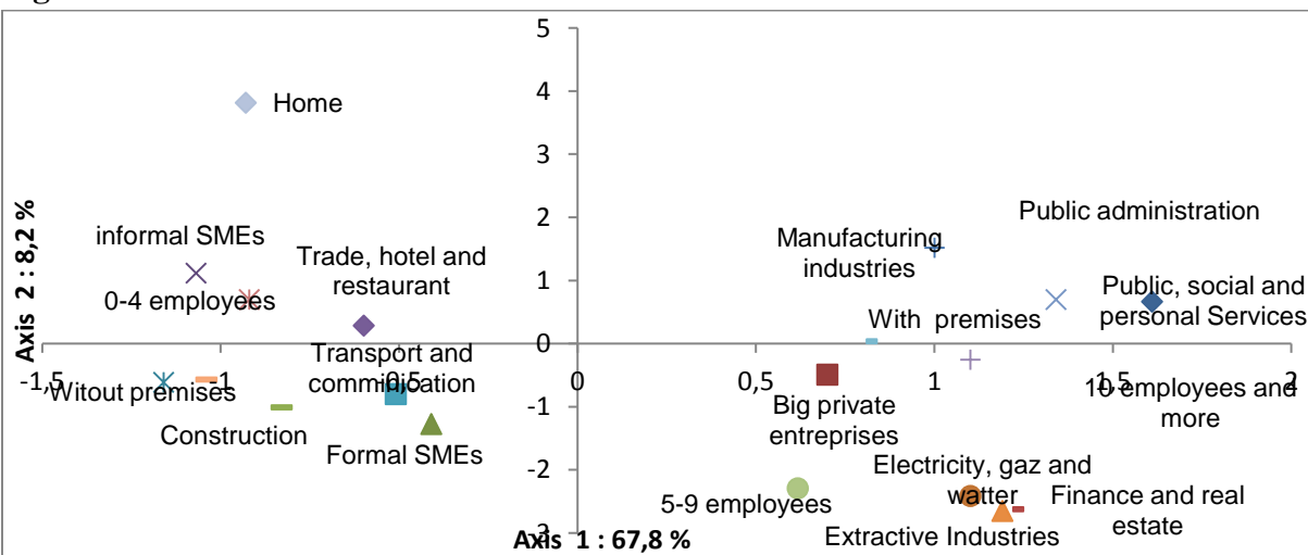
Figure 3. Main characteristics of the informal sector in 2010