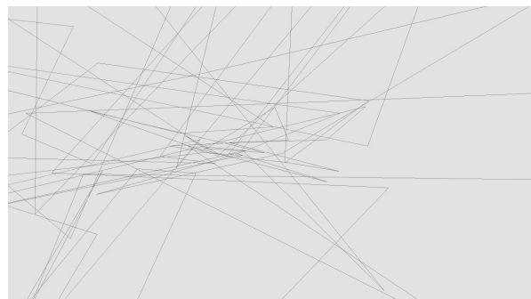
Figure 1. Still image from “Elastic Study

The software for the piece “Elastic Study” was developed in the Max/MSP/Jitter programming environment. The music for this piece was created after testing how Tristan Jehan’s object analyzer~4 (which makes real-time estimations of features like the brightness, noisiness, loudness, etc. of a given sound) could be used to control different variables of a particle system on a 3D scene created with the jit.p.shiva and jit.p.vishnu objects of the Jitter library. The sonic elements of this piece were composed in a way in which they could provide a very flexible control of the elements of this particle system. In order to provide more flexibility to the sound-image relationship of this piece, I integrated a system that would allow to vary the mappings automatically in particular sections of the piece (such as the amount of particles, their variations of colour, duration, inclination, the background colour, transparency and the camera’s position).