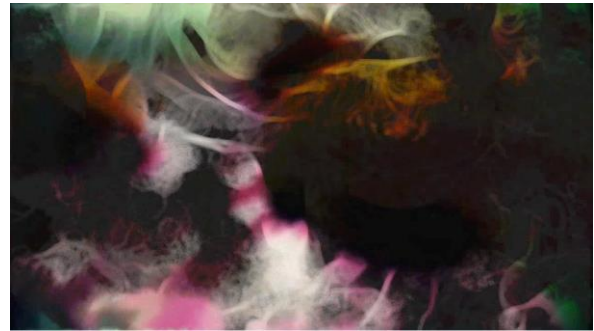
Figure 2. Still image from Las flores y las nubes