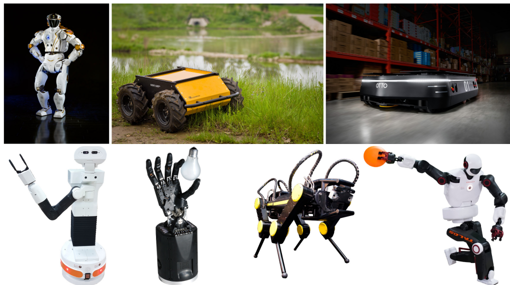
Robot names and credits in order of appearance: Valkyrie (Photo by NASA / Bill Stafford), Husky (Photo by Clearpath Robotics), OTTO (Photo by Otto Motors), TIAGo (Photo by PAL Robotics), Dexterous Hand (Photo by Shadow Robot), HyQ2Max (Photo by Istituto Italiano di Tecnologia), TALOS (Photo by PAL Robotics)