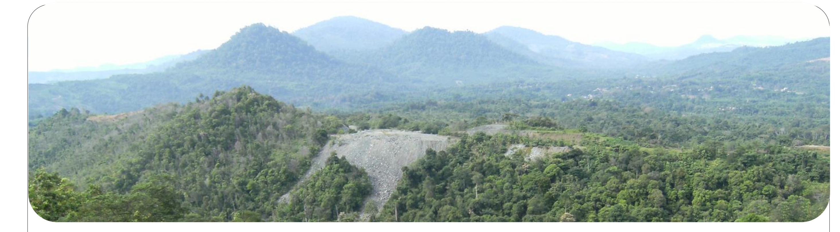
▲ Unvegetated serpentine accumulation at Garas site. Pioneer vegetation, plant functional traits and mesocosm. ▼

15 sampling plots on serpentine quarry tailings and rocky wastes and on serpentine burnt areas. Soil and plant samples collected. Soil cover described. Plant species identification not finished yet. Several functional traits have been registered from field observations, database will be completed upon samples arrival at France.