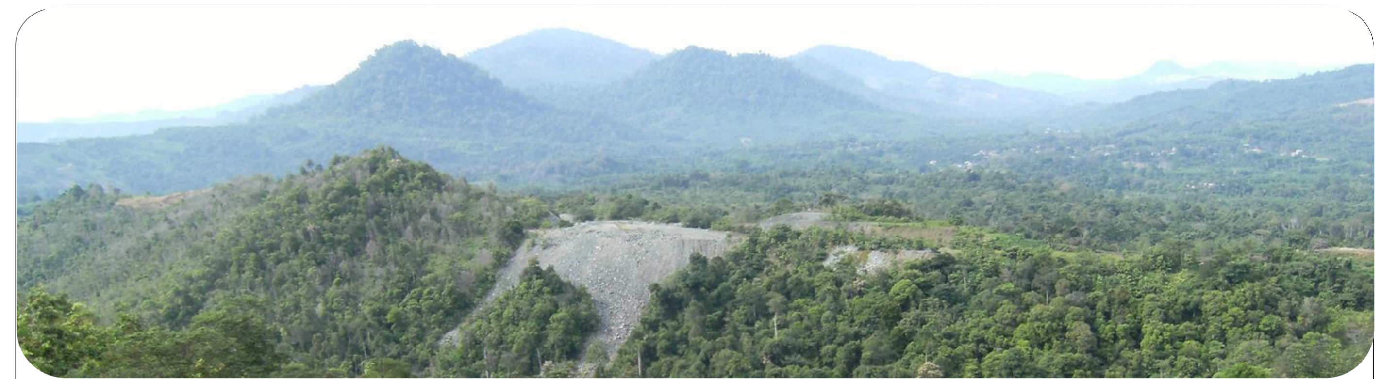
▲ Unvegetated serpentine accumulation at Garas site. Pioneer vegetation, plant functional traits and mesocosm. ▼