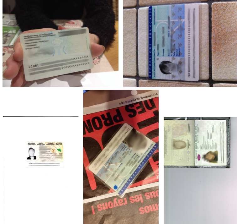
Fig. 1: Sample images from the databases

of approaches is based on text . These methods build a description of the text content (extracted with an OCR in the case of scanned documents), such as bag of words or Word2Vec, which is given as input to classifiers [34]. More recently Recurrent Neural Networks (RNN) have been applied to classify documents [17].