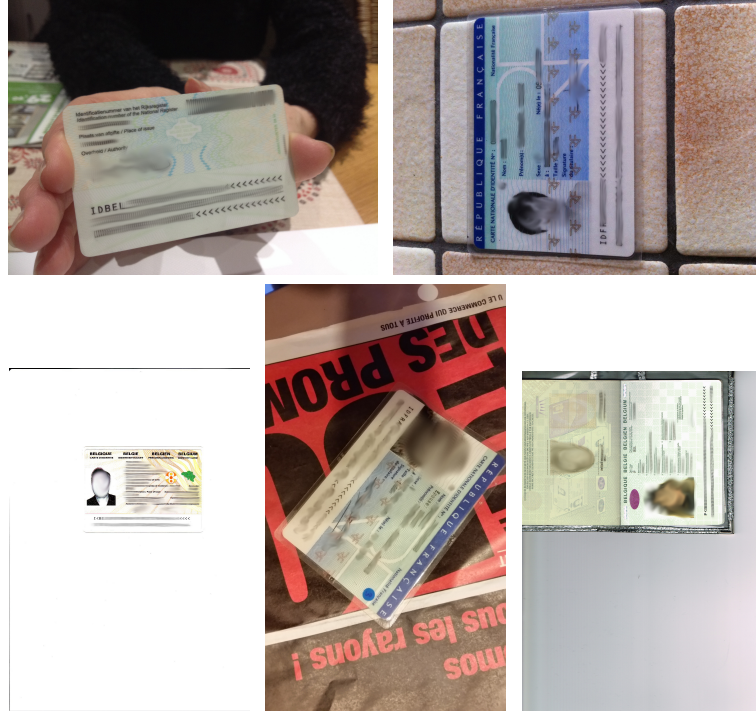
Fig. 1: Sample images from the databases

of approaches is based on text . These methods build a description of the text content (extracted with an OCR in the case of scanned documents), such as bag of words or Word2Vec, which is given as input to classifiers [34]. More recently Recurrent Neural Networks (RNN) have been applied to classify documents [17].