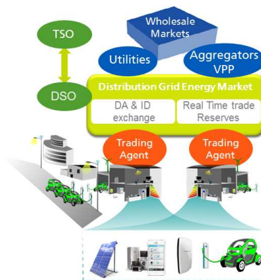
Figure 3: Hierarchical architecture for distribution grid energy management

and to better manage the aggregation of several sectors to provide services and to optimize their demand portfolio on the wholesale markets.