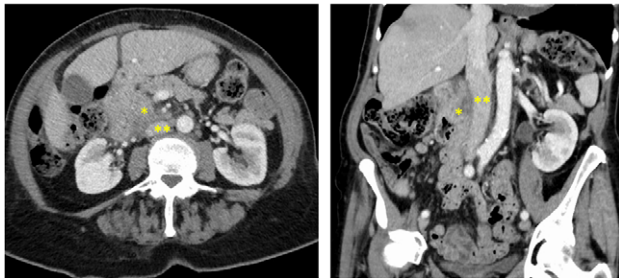
Figure 1: Preoperative CT-scan showing a huge duodenal mass (*) of 7 cm in size developed from the second part of the duodenum, close to the anterior wall of the infrarenal IVC (**).

The patient underwent a bi-subcostal laparotomy. A Kocher maneuver was not possible because of strong adhesions between the tumor and the anterior wall of the IVC. In order to ensure adequate resection margins, we performed a pancreaticoduodenectomy with en-bloc resection of a 3 cm 2 area of the anterior wall of the IVC (Fig. 2A), after total clamping of the right and the left renal veins, and of the IVC from either side of the involved area. Direct suture of the IVC was not possible. We decided not to use a prosthetic graft for the venous reconstruction because of the risk of infection regarding the high rate of infectious complications after pancreaticoduodenectomy, particularly in case of soft pancreas texture. Thus, since the posterior wall of the IVC is usually more floppy than the anterior one because of its higher distance from the renal veins, we harvested a transversal patch of 20 × 30 mm in size from the posterior wall of the IVC, below the confluence with the renal veins (Fig. 2B). We did not encounter any vertebral veins. Reconstruction of the posterior wall of the IVC was achieved by a direct hand-sewn