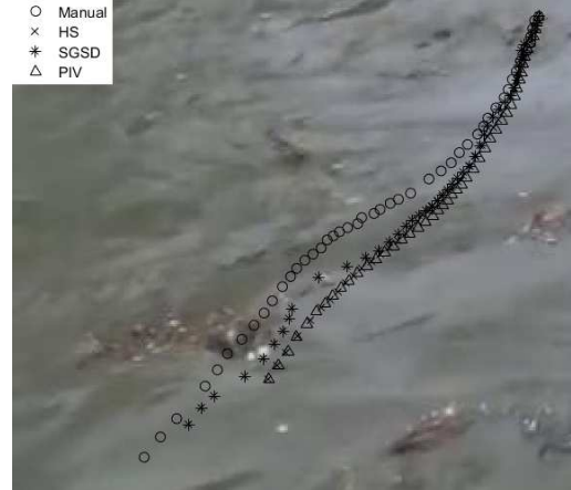
(b) “Gaves de Pau” sequence.