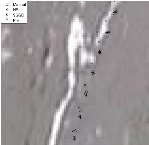
(c) “Arc” sequence, middle of the trajectories