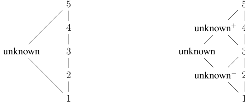
Figure 2: The evaluation space built from the data, in a non-distributive and distributive version (resp. left and right).