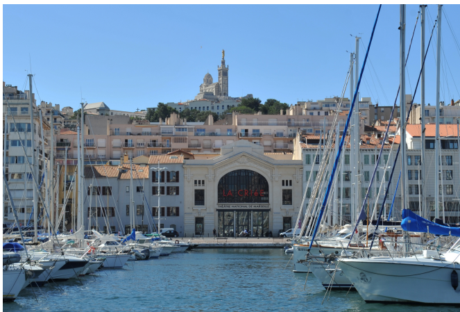
Fig. 1. The two French case studies of the CURRICULA project: Theatre of Le Merlan - National Scene (North Side Marseille) and National Theatre of La Criée (Downtown Marseille)

In the spirit of Max Weber's differentialism, our observations are built on what "culture" means for an urban and amateur of culture in order to identify the scope and purpose of his/her practices and his/her relations to cultural venues.