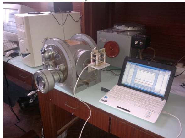
Fig. 1. IMU calibration with a precision dividing head.

In this paper was suggested to use a new method of 3D-calibration. The new calibration method based on whole angle rotation. In fact it is suggested to turn over IMU around three axes simultaneously.