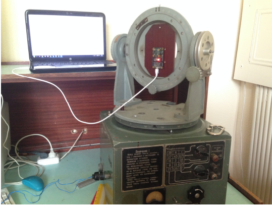
Fig. 2. IMU MAX 21105 calibration with a two axial rate table.