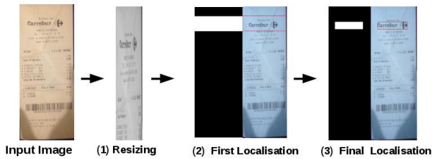
Fig. 3. Logo Localization and classification process

neighboring information (white borders or text) that may impact on the brand classification accuracy.