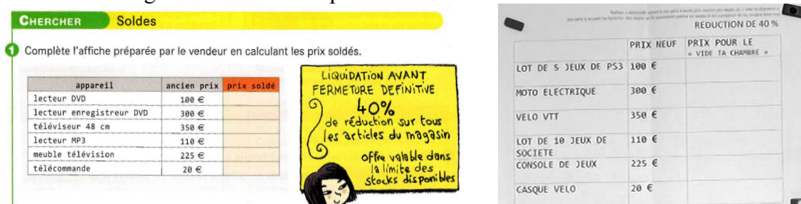
Figure 2: Wording of the mathematical problem as seen in textbook Cap Maths CM2 38 , p. 104, and wording as modified by PEMF D for the class

The classroom observation that took place during a CM2 class (10-11 year-old pupils) focusing on problem solving and more specifically on percentage calculation shows PEMF D changed the author’s wording of a mathematical problem.