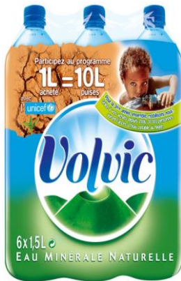
Paper No. 8 - Partnership with Volvic, 2005

this way, the organisation links up with private sector companies or multinationals that generally have significant capital and strong economic activity. One example is a partnership between Unicef and Volvic, a brand of mineral water. This association was first set up in Germany in 2005, then in France and in Europe from 2006 onwards with the aim of helping children in African countries by providing them with drinking water (Document No. 8).