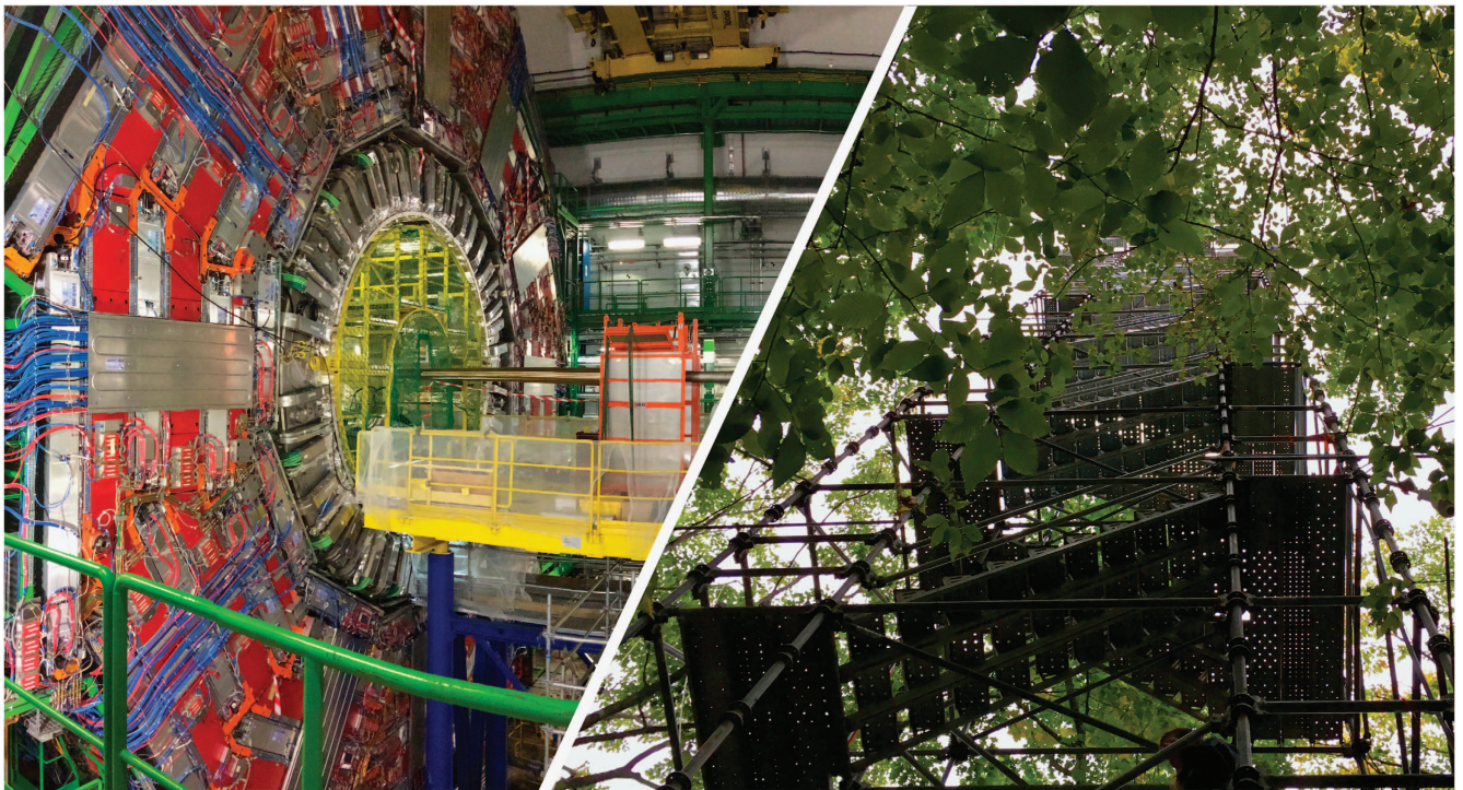
Figure 2. Research teams across the sciences are integrating data provenance methods into their research practices in response to increases in computational demands. On the left: The Compact Muon Solenoid (CMS) experiment at CERN during the technical stop in February 2017. On the right: One of several research towers used for ecological data collection at Harvard Forest. In addition to providing infrastructure for researchers to view the forest at multiple levels in the forest canopy, many instruments for automated observations, such as wind speed, CO 2 flux, and leaf phenology, are placed on these towers. Data are relayed to a controlling computer via a wireless network.

formalized provenance files as a part of their projects. However, this is currently not required nor is it generally done by researchers 22 .