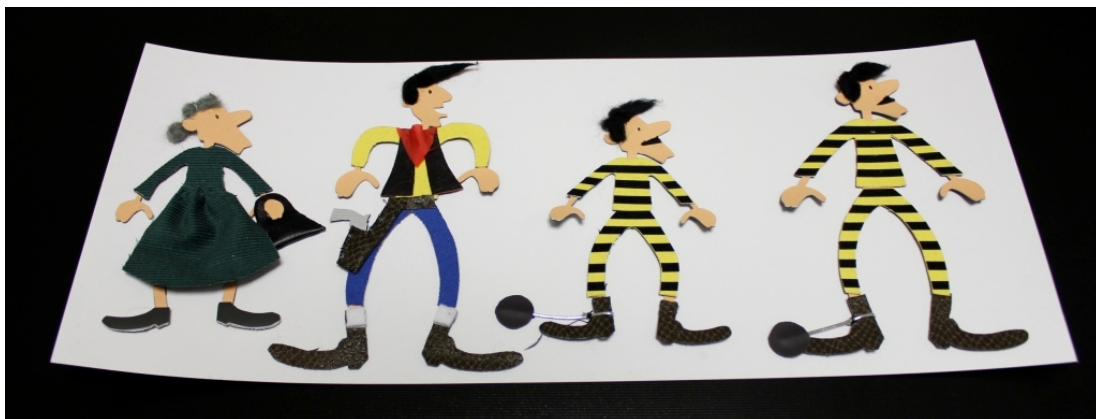
Fig. 3. Tactile image produced using the textures illustration technique. “Lucky Luke” of Morris and Goscinny. Illustration from [33]