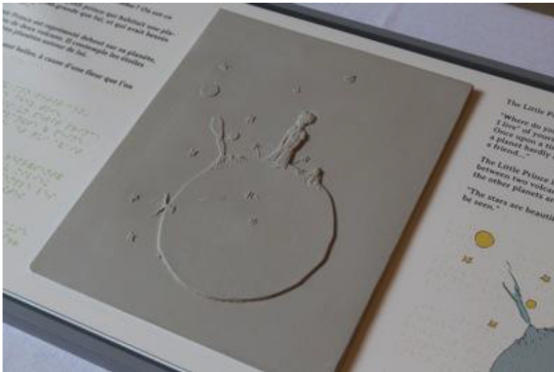
Fig. 1. Tactile image produced using the thermoforming illustration technique. “The Little Prince” of Antoine de Saint-Exupéry. Illustration from [31]