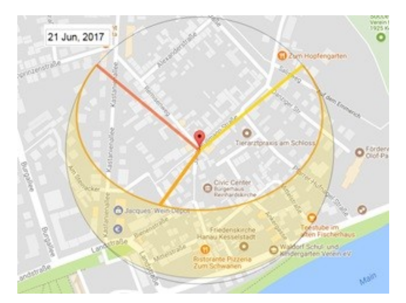
Figure 2 - Thanks to SunCalc.net, we can see that the direction of sunrise on June 21 is coincident with a part of the Jakob-Rullmann-Strasse. The yellow line represents the direction of the sunrise, the red one that of the sunset. The orange arc shows the apparent motion of the sun in the sky.