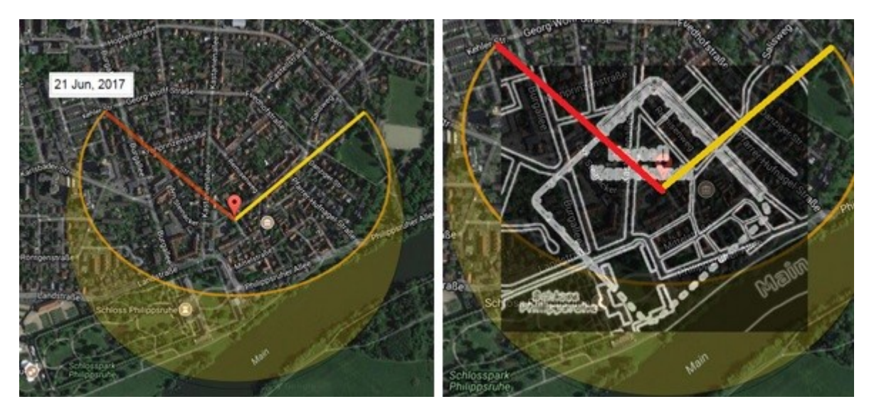
Figure 3 - Using the SunCalc simulation on the satellite map and the Figure 1, we can have SunCalc applied to the Roman fort as in the right panel.

Figure 2 - Thanks to SunCalc.net, we can see that the direction of sunrise on June 21 is coincident with a part of the Jakob-Rullmann-Strasse. The yellow line represents the direction of the sunrise, the red one that of the sunset. The orange arc shows the apparent motion of the sun in the sky.