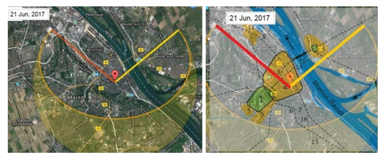
Figure 5 – Using SunCalc, we see that the axis of the fort and of the civil town is oriented along the sunrise on the summer solstice.

Kastell Kesselstadt and Mogontiacum have an evident strategic position, which is conditioning their orientation. However, as we have seen using the SunCalc software they had also a solstitial orientation. Probably, they were deduced with this specific orientation to add a symbolic meaning to the site, linking the fort to the period of the year when the sun is more powerful and strong, that is, "magnus", perhaps in honor of the god of the "might" personified.