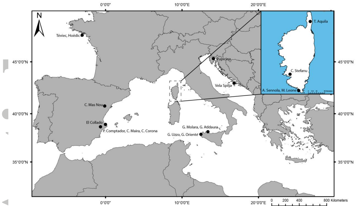
Figure 1. Location of the Mesolithic sites with human stable isotope data in Mediterranean and Adriatic coast.