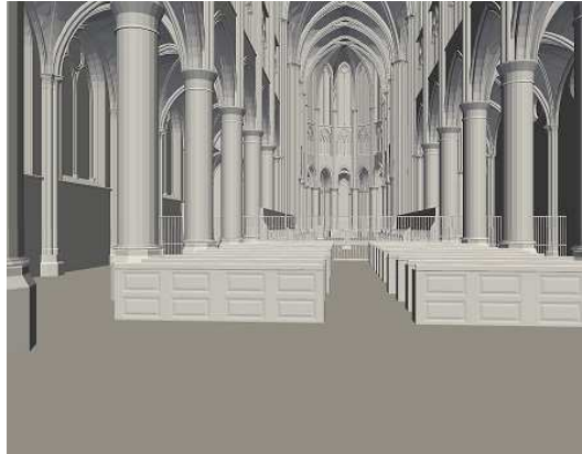
Figure 1: CAD model of the Royaumont church (global interior view)