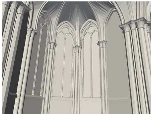
Figure 3: Close interior view of the Royaumont church - CAD model