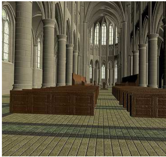
Figure 2: Basic texture rendering of the Royaumont church (global interior view)