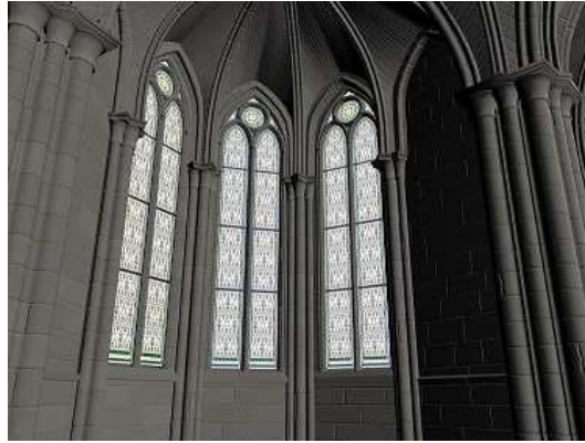
Figure 4: Close interior view of the Royaumont church - Basic texture rendering