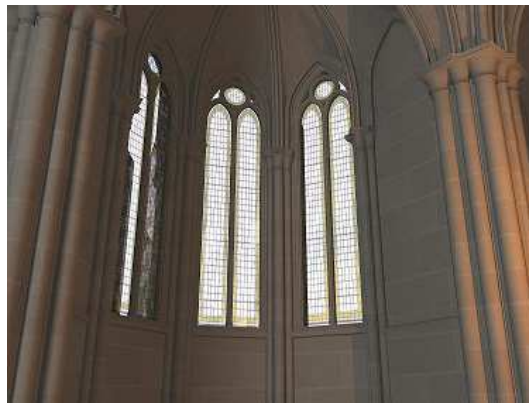
Figure 5: Close interior view of the Royaumont church - Physically-based rendering

As a part of a rehabilitation project led by the Fondation Royaumont, a virtual reconstitution of the destroyed church of Royaumont is being realized. A first step consisted in making up a three dimensional computer aided design model representing the church in a very detailed way. Historians and archaeologists actively contributed with us to the designing of the non-existent edifice. Then, for achieving realistic visual aspects of the interior of the church, taking into account natural lighting and window glasses properties, a physically-based rendering engine was developed. Input physical data were measured on a few remains of the edifice and on samples coming from other similar churches.