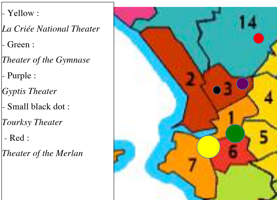
Very centered theaters of the city, from the point of view of La Criée spectators 6

To conclude this first analysis, we would like to highlight four points: (1) Our research aims to bring a focus on the potential ability of cultural institutions to become part – or not – of new regional and urban dynamics and embrace the cultural changes that generate them , (2) we strive to favor a “low angle shot” and bottom-up approach to the cultural audience territorial mobility, and, indirectly, on the local smart specialization predispositions and regional development abilities. The bottom-up approach includes a grounded approach emphasizing the interplay between different social, cultural and economic conditions. It should not be confused with just a new subjective urban vision of the city. (3) We will not focus on new cultural venues, but on older ones. We want to highlight the importance of understanding how European political changes are diffracted by cultural institutions like theaters, museums, operas, etc., and (4) to understand how older institutions invent new adaptive strategies.