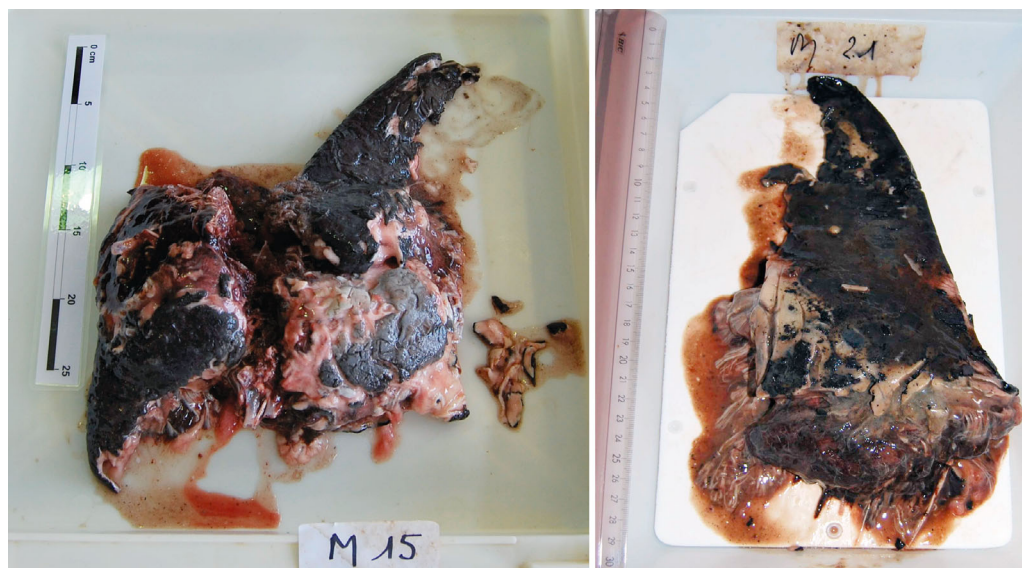
Fig. 3. Dorsal fins of marine mammals in the shortfin makos M15 (left; scale: 25 cm) and M21 (right; scale: 30 cm).