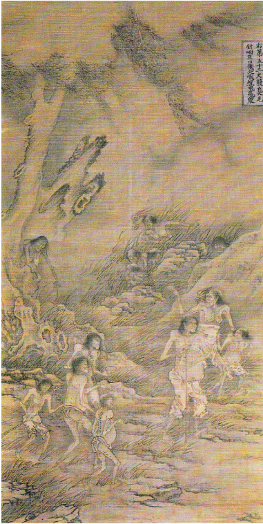
Figure 11 : See end of volume picture's table for full caption.

Aside from their large bellies, 43 these creatures visually recall the firewood carrier depicted by Zhou Chen, who was doubtless familiar with these kind of images, given the popularity of Water and Land rituals during the Ming and Qing dynasties. Thus, Water and Land rite paintings were arguably visual precedents for this figure.