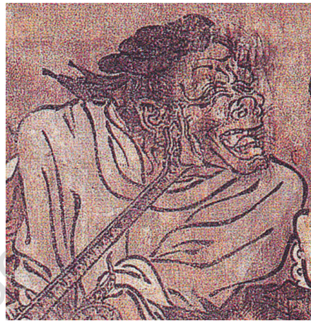
Figure 6 : Detail from Ghosts of Those Who Died Violent Deaths , late Yuan dynasty. Wall painting, Qinglong temple, Shanxi

Similarly, another pair of male characters, displaying black-and white painted faces, might have enacted some kind of ritual performance (Fig. 7). One is carrying a flag; the other is waving a yellow rag. The style of facial make-up, gestures and costumes, as well as the spatial arrangement of the two figures, recall actors on a stage. Their basic make-up, which leaves their eyes, nose and mouth uncovered, is characterized by the contrast