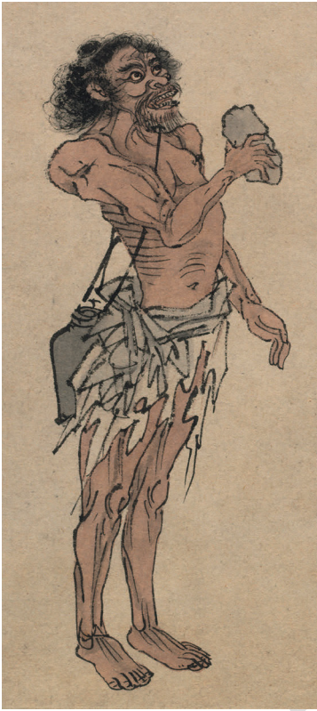
Figure 15 : Zhou Chen, detail of Beggars and Street Characters

through the street of the capital, striking drums and beating gongs in order to expel evil forces. Zhong Kui's night excursions remained a popular subject throughout the Ming dynasty, and Zhou Chen was no doubt familiar with some of these past models (he himself painted a handscroll of Zhong Kui and his sister riding an ox and a horse, escorted by a procession of demons 48 ), arguably borrowing some visual conventions from earlier paintings on the theme of the demon-queller. 49