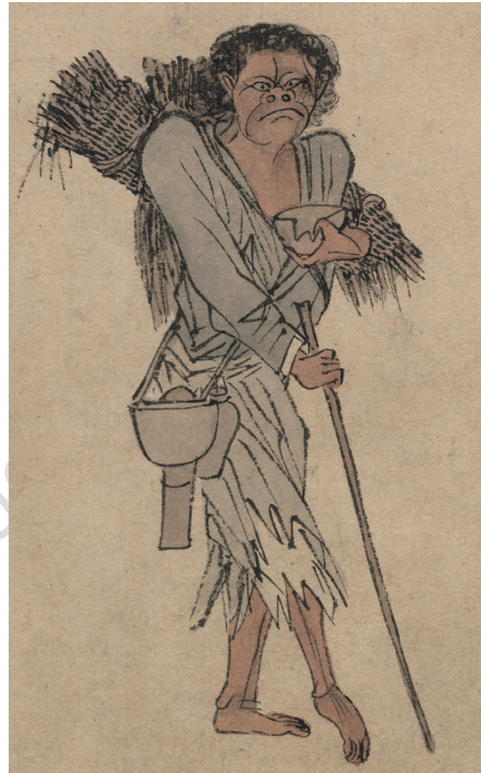
Figure 13 : Zhou Chen, detail of Beggars and Street Characters . See end of volume picture's table for full caption

Taking an almost frontal stance, the beggar has turned slightly to meet the viewer with a direct gaze. He seems to show