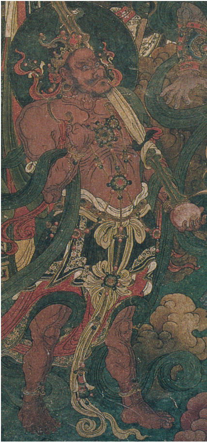
Figure 16 : Anonymous, Guardian Figure , 15th century. Section of a wall painting, Fahai Temple, Beijing Source: Zhou, Huashen yuyun, p. 46. © Cleveland Museum of Art

employing it as a “weapon” too, since the rock can be identified as a coercive tool beggars used to elicit alms from potential donors. If refused, the beggars would start to hit themselves with rocks, inducing people to give a few coins to get rid of them. The powerful body of this beggar, virtually unprecedented in the history of Chinese secular art, evokes a Vajrapani (Chinese: Jingang lishi 金剛力士), a protector deity usually depicted with bare chest and bulging muscles. Often shown with non-Chinese facial features (round and protruding eyes, prominent nose and eyebrows, wild hair and beard) and skin tone, Vajrapani is primarily a yakṣa . 50 Understood to protect the Buddha and control demons, he shares some of the physical attributes of ghosts and monsters. His terrifying form is therefore suitable for representing a demonic defender supposed to frighten away the forces of evil. 51 The figure of one such protector deity from a Ming dynasty mural in Fahai temple 法海寺 near Beijing (Fig. 16) was arguably a visual precedent for the muscular beggar, as Richard Barnhart has