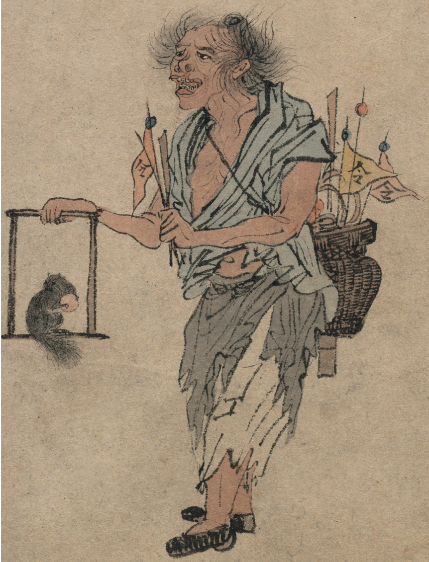
Figure 17 : Zhou Chen, detail of Beggars and Street Characters

pointed out. 52 The eyes of the dark-skinned vajrapani are as round, protruding and wild as those of the beggar raising a rock; the positions of their muscled bodies are also comparable.