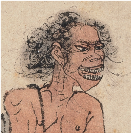
Figure 5 : Detail of fig. 1 Demonic street sweeper

As for the demonic street sweeper (Fig. 5), his distorted face resembles that of one of the ghosts who died a violent death depicted in a late Yuan dynasty (1271–1368) mural on the northern wall of Qinglong temple 青龍寺 in Shanxi (Fig. 6). Standing next to a skeleton in chains and shown in three-quarter view, the ghost's physiognomy is comparable to that of our street sweeper: a snubbed nose with flared nostrils, a gaping mouth displaying upper and lower fangs, and a protruding chin. 30