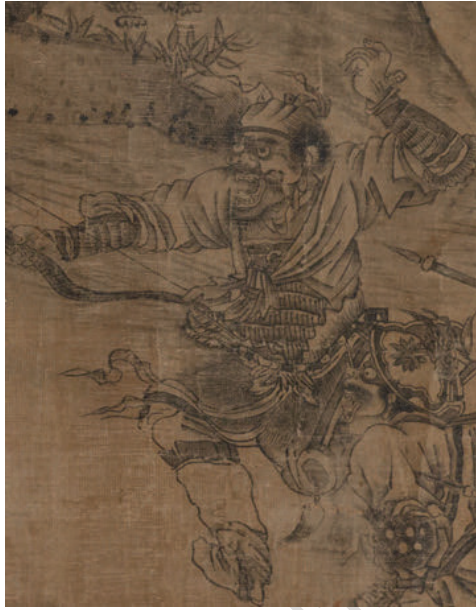
Figure 4 : Anonymus , detail from Searching [for Demons] on Mount Guankou ( Guankou soushan tu ), ca. 1500. Hand-scroll, ink on silk, 48.4 x 935.9 cm, Princeton University Art Museum

The facial and corporeal features of the demon soldier holding a hunting bow and those of the beggar raising a paddle are similar: their protruding eyes, bared sharp teeth and angry roars suggest that they are both producing battle cries. Equally, the posture of the ghost-soldier is akin to that of the beggar-exorcist: both bodies are tense and straining with the effort of brandishing their weapon of demonifuge. 28 These similarities may have their raison d'être in the fact that the beggars here have similar roles: expelling demonic and threatening malevolent forces. 29