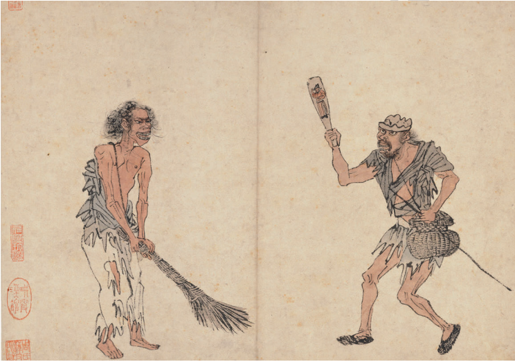
Figure 1 : Zhou Chen (ca. 1455-after 1536), detail of Beggars and Street Characters ( Liumin tu ), 1516. Album leaves mounted in handscroll, ink and colors on paper, overall 31.4 x 245.3 cm, Honolulu Academy of Arts (2239.1: 1956).

Consider, for example, the last double leaf of the Honolulu scroll, which depicts two beggars who present demonic attributes and may be simultaneously understood in a ritual context (Fig. 1).