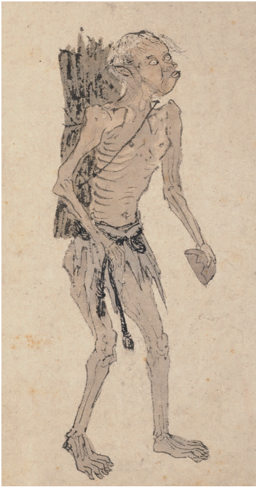
Figure 10 : Zhou Chen, detail of Beggars and Street Characters

Through precise iconographic tools, illustrations from tenth-century versions of the “Scripture on the Ten Kings” ( Shiwang jing 十王經), from Dunhuang, indeed show two possible paths for the deceased: while “good” people (those whose families have sent offerings) are well dressed and serene, “evil” people (sinners who lack support from their families) are confined in cangues and scantily clad in loincloths that reveal their bare chests, arms and legs. 40 Later sets of paintings depicting the ten kings of hell, such as those produced during the twelfth and thirteenth centuries by workshops of Ningbo, include scenes of torture and punishment in the lower register of each scroll. Relegated to the bottom of the paintings, penitents are emaciated and semi-naked, blood running over their bodies. 41