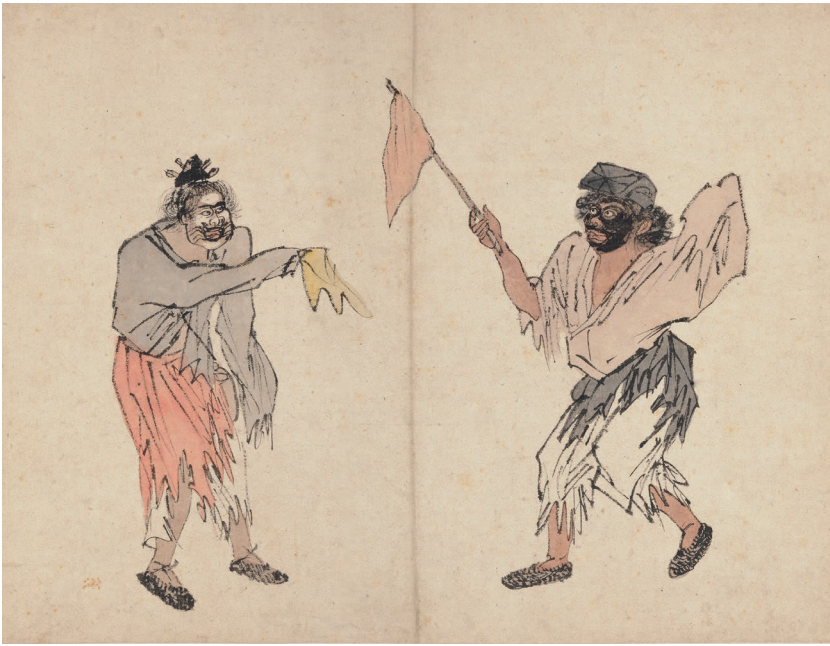
Figure 7 : Zhou Chen, detail of Beggars and Street Characters

between black and white. One might thus be tempted to speculate that the two are playing the roles of the paired Demons of Impermanence ( Wuchang 無常 or Wuchang gui 鬼). 31 An emissary from hell, Wuchang escorts dead souls down to the netherworld for judgment. Depending on the context, he may be alone, with his family, or in a pair with his alter ego, the Black Wuchang . 32 Paired Wuchang characters are known as the Black and White Wuchang ( heibai Wuchang gui 黑白無常鬼). Unfortunately, both literary records and visual sources regarding this couple are scarce prior to the late Ming (1368-1644) or the early Qing (1644-1911) dynasties, making it difficult to assess which roles these