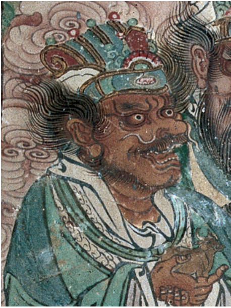
Figure 9 : Anonymous, Star of root destiny , ca. 1500. Section of a wall painting, Pilu temple, Hebei.

a congenital elevation of the scapula known as “Sprengel’s deformity”. Moreover, his mouth appears to be affected by a facial nerve paralysis, conferring a bestial quality upon him. Pictorially, the treatment of his visage recalls some baleful stars ( xiongshen 凶神, “cruel divinities”, or shaxing 煞星, “murderous stars”)—with their fierce and disturbing appearances and grimacing faces—found, for example, in Water and Land ritual murals in Pilu temple 毘盧寺 in Hebei, dating to the late fifteenth century. For instance, one of the twelve stars of root destiny ( Shi’er Yuanchen 十二元辰) (Fig. 9) has similar facial features: seen in three-quarter view, his twisted face with its protruding eyes, disheveled hair, and wild open mouth showing rows of menacing teeth evokes the beggar’s terrifying visual details.