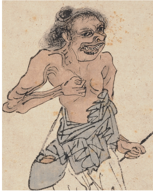
Figure 8 : Zhou Chen, detail of Beggars and Street Characters © Honolulu Academy of Arts

this painted duo closely and thus to determine their exact role. 37 To be sure, Zhou Chen's painting may not be taken as an exact representation of social realities; as such, it must be treated with caution. What is important in this case is to call attention to the multi-levelled relationship between ghosts and beggars, epitomized by the active role beggars played in ritual ghost expulsions. Beggars and the local poor dressed up like demons, not only because it was considered "a dangerous and polluting job that nobody else would willingly assume", 38 but also—and more importantly—because, as B. J. ter Haar has pointed out, being marginalized outcasts, they "were, in many ways, the real life equivalents of the demonic beings they enacted". 39