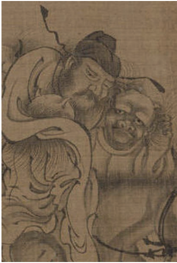
Figure 12 : Yan Geng (active ca. 1300), detail from Zhong Kui Giving off His Sister to Marriage ( Zhong Kui jiamei tu ). Handscroll, ink on silk, 24.4 x 253.4 cm, Metropolitan Museum of Arts (1990.134)