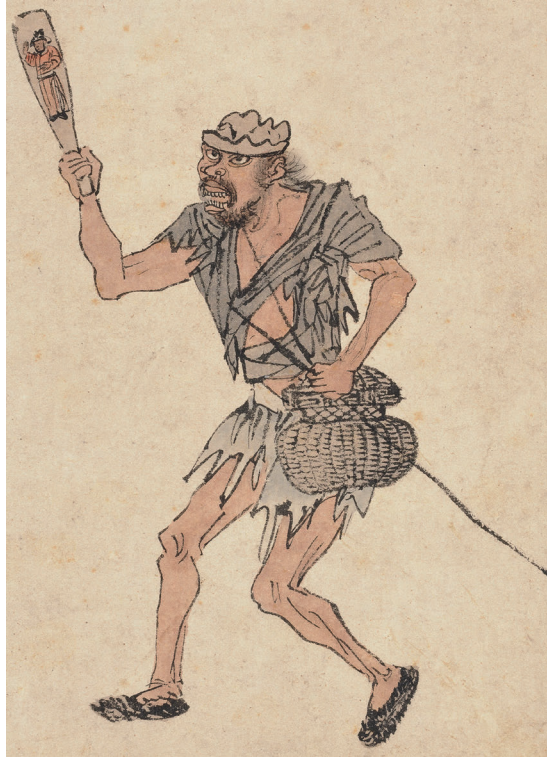
Figure 3 : Detail of fig. 1: Beggar brandishing a paddle

origin. 26 The figure on the left (Fig. 3) may be compared to one of the fearsome demons appearing in one version of “Searching [for Demons] in the Mountains” ( Soushan tu 搜山圖), which dates to around the mid fifteenth century (Fig. 4). 27