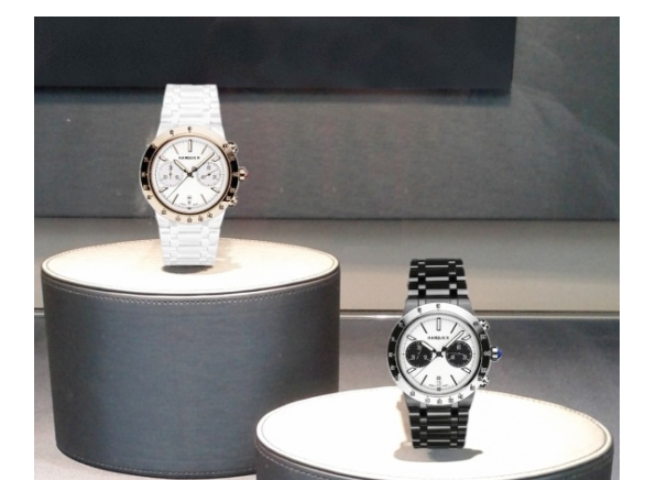
Price display in the store window