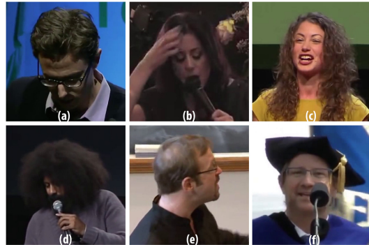
Figure 2: Challenges encountered under unconstrained conditions: occlusions (b), (d), (f), pose (a), (e), illumination (a), (b), expressions (c). Images from 300VW (Shen et al., 2015).

datasets do not cover all the difficulties encountered by applications. The constraints related to the movements of persons or cameras are not currently considered. A dataset composed of image sequences captured under unconstrained conditions has recently been published by (Shen et al., 2015) (cf. Figure 2). This data, in addition to being more realistic, provides some clues in favor of the use of temporal information for face alignment.