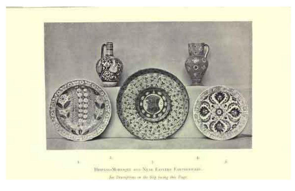
Catalogue of Persian and Arab Art, BFAC

Catalogue of Persian and Arab Art , Burlington Fine Arts Club, 1885