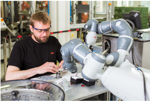
Fig. 2: An example of human-robot collaborative manipulation in a productive environment.

standing the wide margin of applications, collaborative tasks that involve simultaneous interaction with rough or uncertain environments (e.g. co-manipulative tool-use) can induce various unpredictable force components to the sensor readings [Peternel et al., 2014]. This can significantly reduce the suitability of such an interface in more complex interaction scenarios since it can be difficult to distinguish the components related to the active counterpart(s) behaviour from the ones generated from the interaction with the environment.