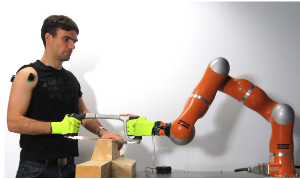
Fig. 3: Authors in [Peternel et al., 2016b] proposed a human-robot co-manipulation framework for robot adaptation to human fatigue. The myoelectric interface provides the robot controller with a feedback about human motor behaviour to achieve an appropriate impedance profile in different phases of the task. The human fatigue estimation system provides the robot with the state of the human physical endurance.

A remarkable use of bio-signals in the development of HR interfaces is to estimate the human physical (e.g. fatigue) or cognitive (anxiety, in-attention, etc.) state variations that might deteriorate the collaborative robot'(s) performance. The authors in [Rani et al., 2004] developed a method to detect human anxiety in a collaborative setup by extracting features from EMG, electrocardiography (ECG) and Electrodermal responses. In a similar work, the human physical fatigue was detected and used to increase the robot's contribution to the task execution [Peternel et al., 2016b].