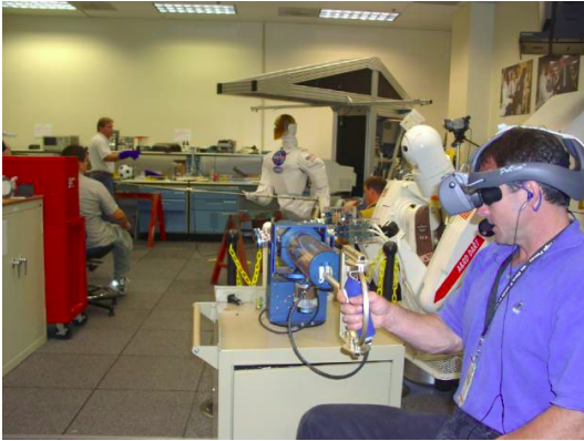
Fig. 5: An example of providing haptic and visual feedback (via AR) to the human counterpart in collaborative settings [Glassmire et al., 2004] (image courtesy of M. O'Malley).

only through physical interaction 3 . Although haptic feedback can temporarily be sufficient to achieve sub-tasks, if contextual information about the task phase are provided, for the interaction to be efficient more non-verbal cues are necessary to recognize the partner intent during collaborative tasks and synchronize the dyadic activity. In this sense, joint attention or proactivity can improve the mutual awareness, hence the task performance, as shown by [Ivaldi et al., 2014] for a dyadic learning task.