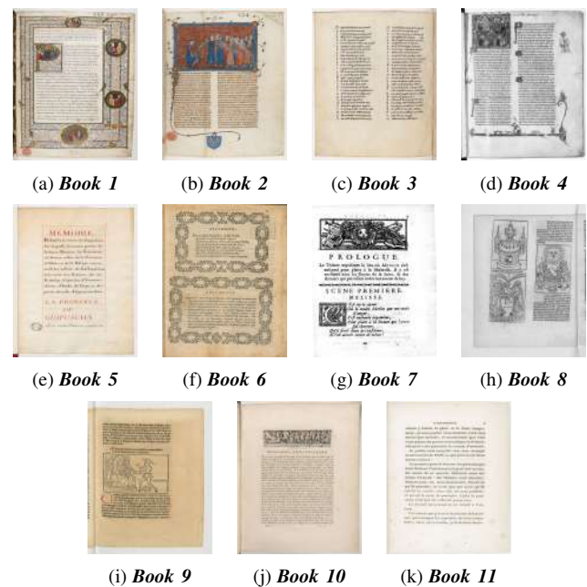
Fig. 1. Sample book pages of the HBA 1.0 dataset.

The 11 URL links of the books of the HBA 1.0 dataset mentioned above will bring you to the French digital library Gallica 2 where only low resolution images are publicly available online. The 11 books of the HBA 1.0 dataset follow very different formatting rules (e.g. manuscript/printed, layout, language, script, character fonts, font sizes). The characteristics of the HBA 1.0 dataset are primarily: strong heterogeneity, with differences in layout, typography, illustration style, historic fonts, complex layouts (e.g. dense printing, irregular spacing, varying text column widths, marginal notes), ink shining through and historical spelling variants, etc. In addition to this specificity, the issues affecting document image layout analysis, such as the degradation properties (e.g. yellow pages, ink stains, back-to-front interference) and scanning defects (e.g. defects of curvature and light) are adequately covered. It is worth noting that the HDIs of the HBA 1.0 dataset were selected so as to be as realistic as possible, in order to reflect that there is still much room for improvement in HDI layout analysis due to the mentioned particularities of HDIs. Figure 1 illustrates few samples of book pages of the HBA 1.0 dataset.