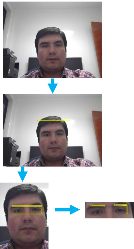
Figure 1: Cascade detection when user's eyes are open

In the case of Figure 2, since the person has their eyes closed (possibly by blinking), the algorithm only recognizes the eye and the two eyes together without identifying the right eye and the left eye Independent.