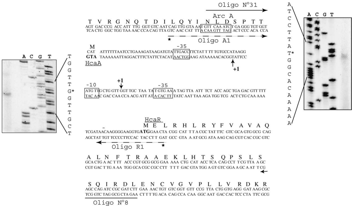
Fig. 1. The intergenic region between hcaR and the hca A1, A2, C, B, D operon. Vertical arrows indicate the transcription start sites (+1). The -35 and -10 regions and the proposed ArcA binding site are boxed. Sequences of primers used to amplify the fragment tested for gel retardation experiments (oligo 31 and oligo 8) are indicated by plain arrows. Mapping of the transcription starts at hcaR and the hca A1, A2, C, B, D operon. Total RNA was extracted from E. coli strain FB8 grown in minimal medium in the presence of succinate. Primer extension experiments were performed using A1 oligonucleotide R1 (dashed arrow), for hcaR and B oligonucleotide A1 (dashed arrow) for hcaA . Sequencing reactions (lane ACGT) were performed with the (R1) or (A1) oligonucleotides and pDIA 10120 as template. An asterisk indicates the 5' end of mRNA.