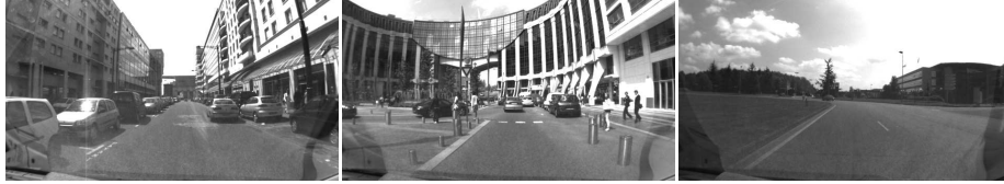
Figure 1: Images of sequence 1.